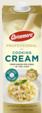
15% Cooking Cream