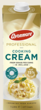
15% Cooking Cream