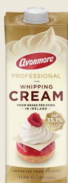
35.1% Whipping Cream